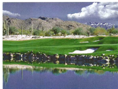
Tucson links: The Ritz-Carlton Golf Club, Dove Mountain

Metropolitan Tucson Convention & Visitors Bureau, (800) 638-8350; visit tucson.org MC